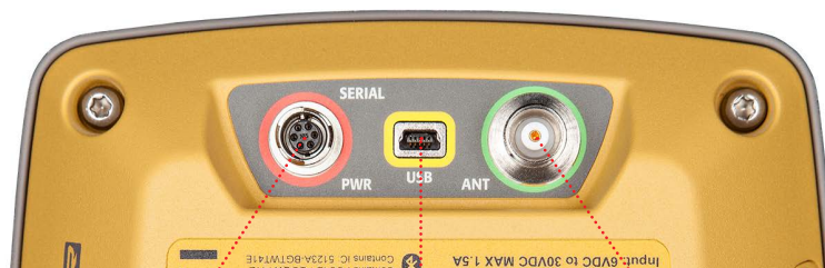
Waterproof Communication and Charging Port